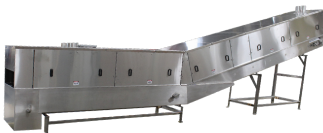
CUSTOM EGG WASHING CONVEYOR

The tank enclosure was constructed from 316 stainless steel and food grade plastic, and included removable side panels. Mounted bearings had stainless steel housings and stainless steel inserts to ensure the customer's cleaning regimen and sanitary