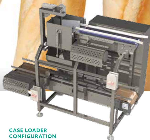
CASE LOADER CONFIGURATION

Robust and advanced system designed to count and collate singulated products