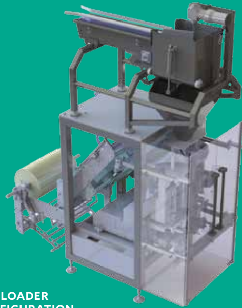
BAG LOADER CONFIGURATION